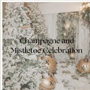
Champagne and Mistletoe Celebration

Access from 3pm including Oak Lodge Fizz and Canapes on Arrival Delicious Festive Buffet DJ & Disco 1am Carriages