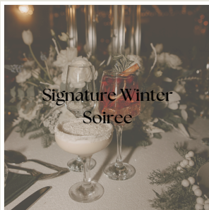
Signature Winter Soiree

Fizz and Canapes on Arrival DJ & Disco 12am Carriages