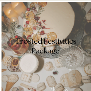
Frosted Festivities Package

Fizz and Canapes on Arrival DJ & Disco 12am Carriages